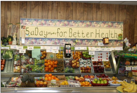
Rural grocery stores like this one can often be seen in Western Kansas.