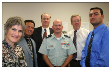
Engagement incentive grants build campus collaboration and strengthen campus/community partnerships.

Additionally, the seed funding provided by CECD is returning about $2.1 on every dollar invested. It is clear that K-State is engaged with citizens and communities in numerous ways and that the Engagement Incentive Grants are a small, but important element of K-State's engagement mission.