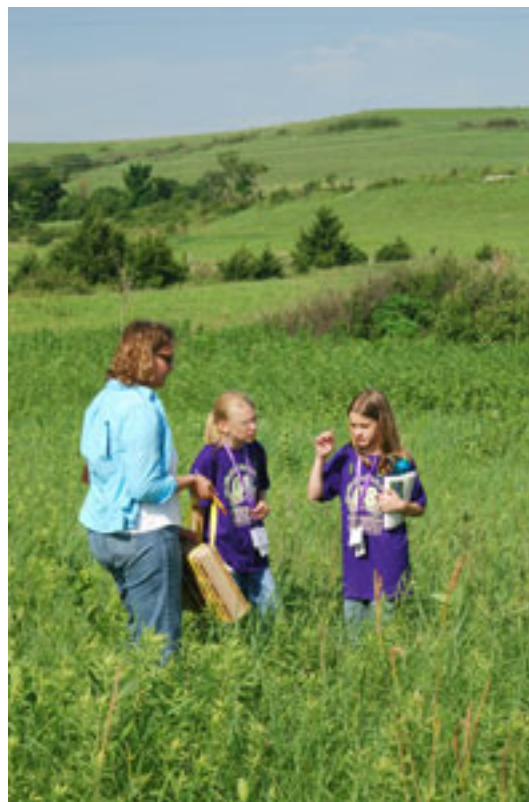
One Health Kansas offers hands-on interactive programs targeted to K-12 students and educators.

One Health Kansas has several goals. First, to develop outreach programs for the general public, K-12 students and their teachers. Second, to develop an introductory survey course focused on public health topics. This course is offered jointly by K-State and Kansas community college partners and became available this fall. Finally, One Health Kansas plans to develop new courses and modules to infuse One Health concepts into existing public health classes and curriculum.