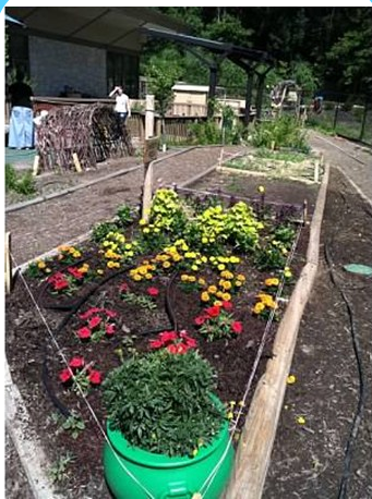
Rainbow garden – a great way to learn your colors!

It is getting warmer outside and time to bring your child's sunscreen. It will be applied every day for your child beginning April 1. Please put your child's name on the sunscreen. No aerosol sunscreen is allowed. Please remember to check the expiration date. Thank you.